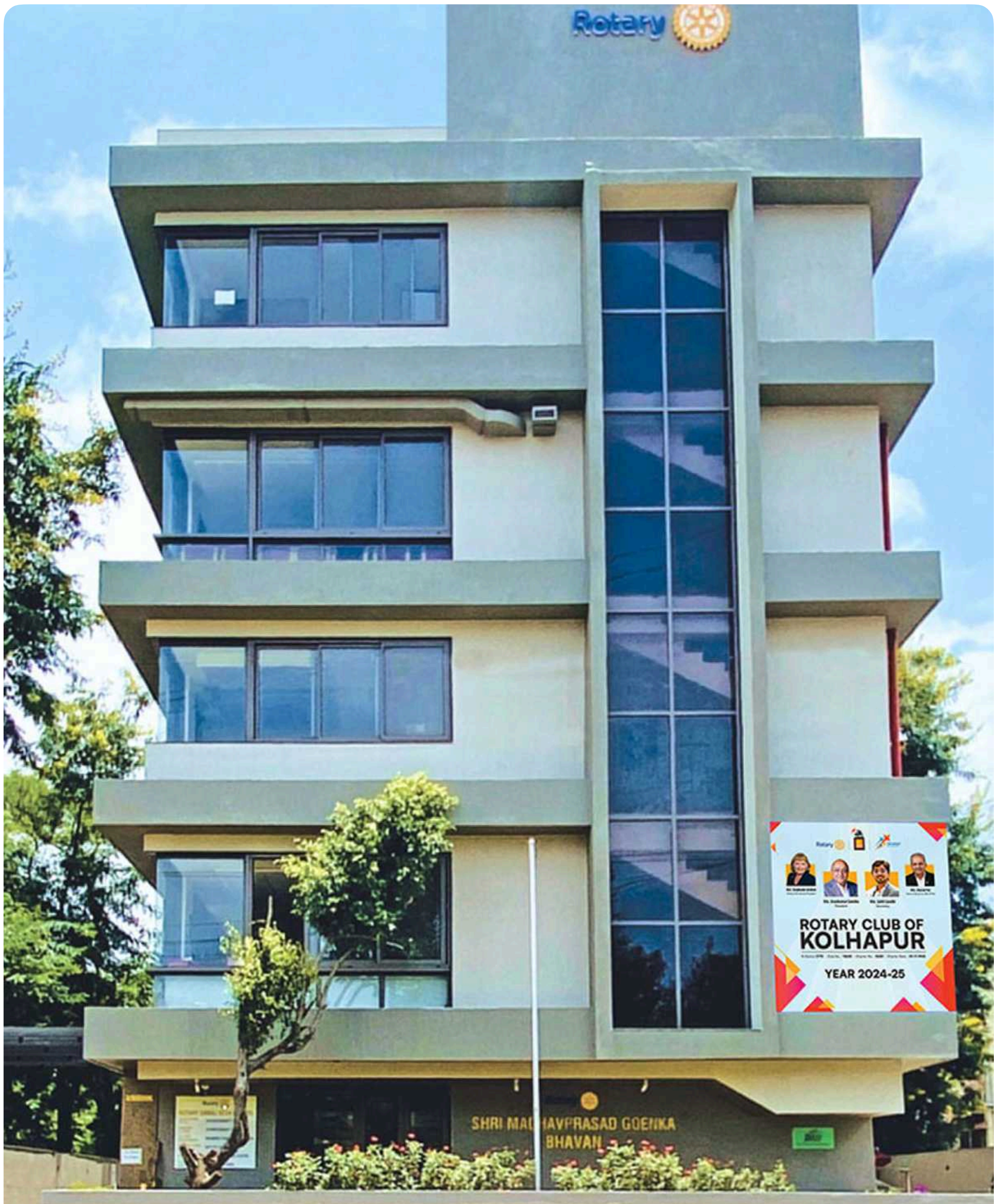
ROTARY CLUB OF KOLHAPUR'S ROTARY SAMAJ SEVA KENDRA BUILDING